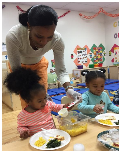
A snapshot of “Family Style Service”