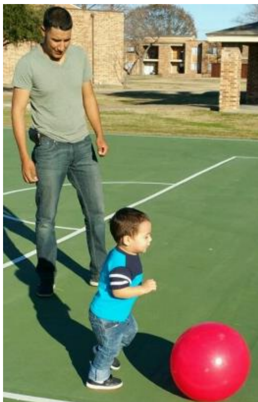
Father and child engaging in physical play, while encouraging the development of his fine motor skills

When fathers are engaged in fun activities, which includes reading to their children, it strengthens their bond and helps their children succeed academically.